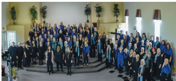
100 Choristers, Musicians and Clergy in a Rural Cluster for a June 1 Service

In major cities, many towns, some rural areas and Indigenous