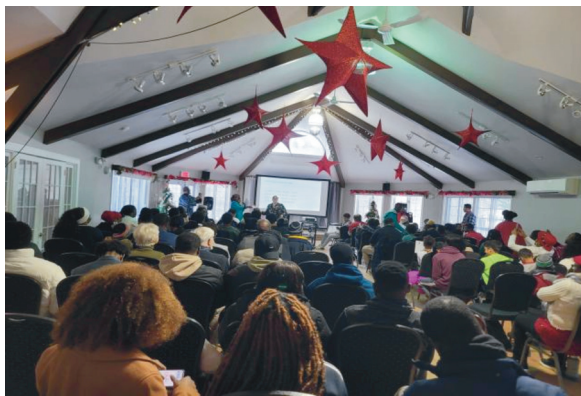
100 Black, Francophone, Immigrant Youth Rallying in a Fast Growing Element of United Church Life

Doubts about church growth predicted in The Untied Church , and in the UC Strategic Plan, were overcome recently as over 100 United Church youth gathered a conference, on the theme Nous ne sommes plus des étrangers! (We are no longer strangers!) All francophone, all black, and from African immigrant families. They met at l'Église Unie Plymouth-Trinity in Sherbrooke, Québec, on November 29, 2024. Such growing coteries may continue the current expansions of our denomination with support for racialized and linguistic endowments to be highlighted in anniversary services, like a new francophone ministry beginning in Moncton late in the anniversary year, and L'accueil Église Unie, in Winnipeg, and much more in between in Quebec and Ontario.